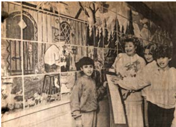
A mural of the scenery from "Beauty and The Beast"