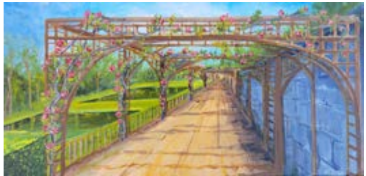
BEST IN ACRYLICS: Bev Sirianni "Rose Trellises" COMMENTARY: Great Composition and use of perspective...it was a toss up between awards Best in Acrylics or Best in Composition