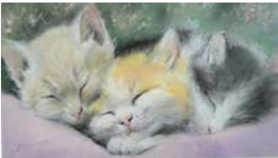
BEST IN PASTELS: June Coles "Napping" COMMENTARY: The use of pastel works with the softness of the kittens...I've heard that pastels are not easy to work with...Congratulations