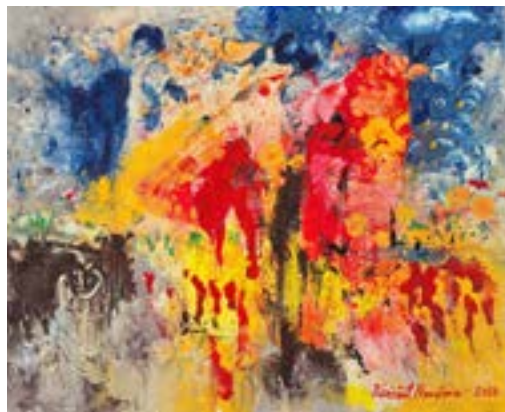
Far Left: BEST IN SEASCAPE: Linda Hejduk Acrylics "Twilight on the Bay" COMMENTARY: Use of brush marks and energy of the hues... we've all seen this moment