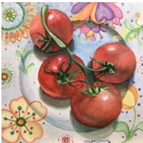
Right: BEST IN REALISM: MaryAnn Goodwin Watercolor "Tomatoes on a Plate" COMMENTARY: Who doesn't like a good Jersey tomato... I thought it was colored pencil at first but the shading technique was a plus in my evaluation