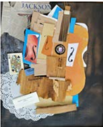
BEST IN MIXED MEDIA: Robert D'Imperio "Table 6" COMMENTARY: Great composition and use of materials