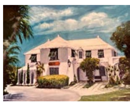
Tom Moore's Tavern