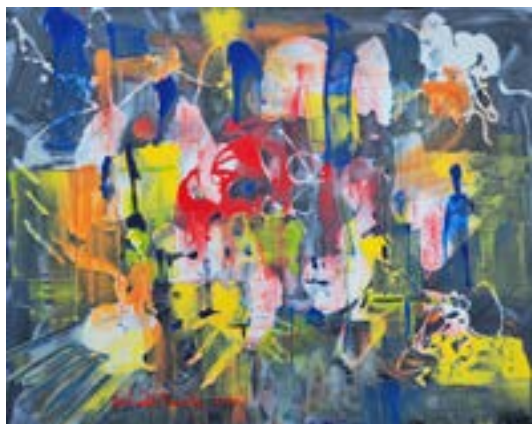
"The World of A Visionary", Casein on Conservation Board