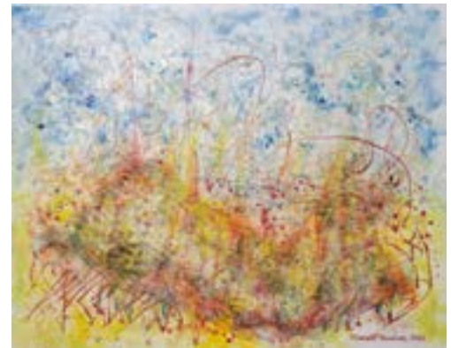
"Shoreline Wisp", Encaustic Wax on Metal