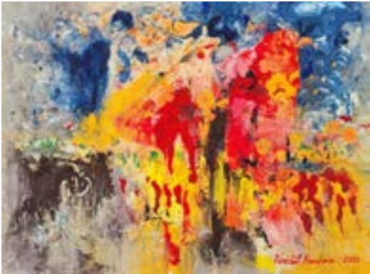
"Beach Apparitions", Casein on Board