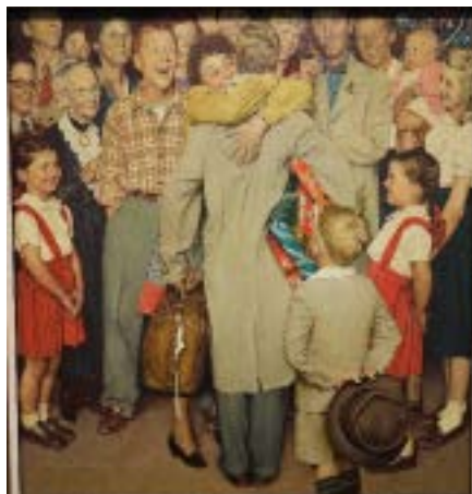
"Christmas Homecoming". The whole Rockwell family appears in this 1948 painting, even Grandma Moses did a cameo appearance. She's not hard to find