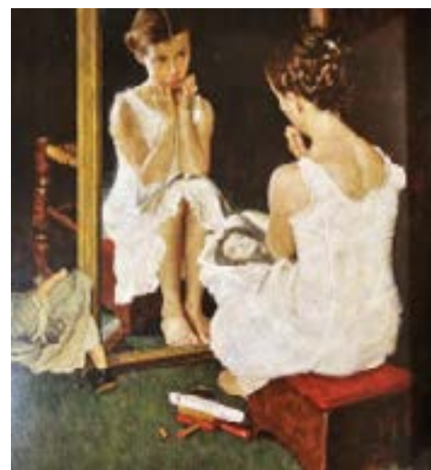
"The Girl in the Mirror " 1954 The study for this painting (above) The final cover for Saturday Evening Post Rockwell commented that he "should not have added the photo of movie star Jane Russell. The young girl is not wondering if she looks like the star, but just trying to estimate her own charms"