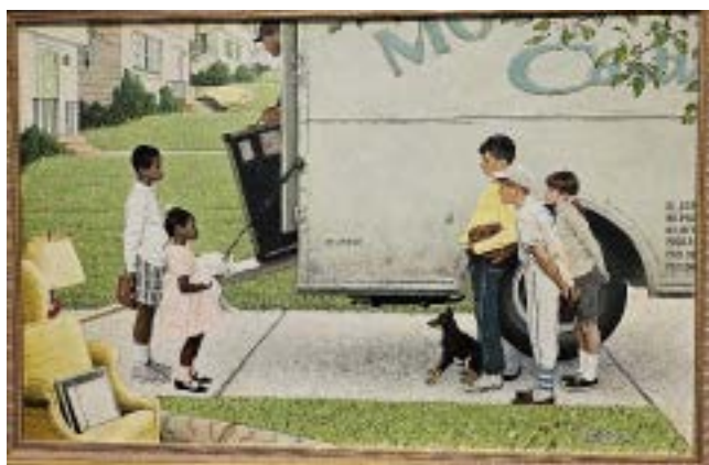
Portraying the integration in communities in the 1960's, Rockwell expressed his belief in humanity and the wisdom in children. With much in common, it appears likely that these young subjects will soon be playing ball with each other.....baseball mitts in hand.

So many more of his works I could have shared. It's an amazing exhibit in a beautiful setting. I guess you will just have to take a ride to Stockbridge and see for yourself. Road Trip!