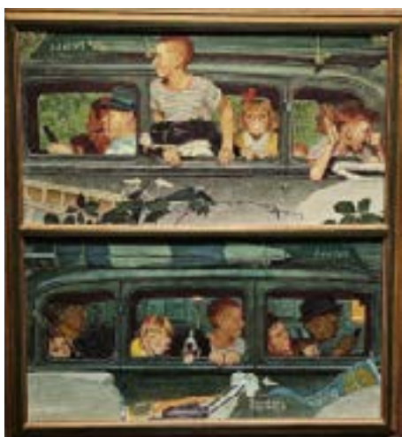
"Coming and Going" (left) Two sequential panels showing a post war afternoon family out for a drive. One of excitement and anticipation and one of exhaustion and fulfillment. Note: only one character remains stalwart throughout, providing continuity throughout. Can you guess who?