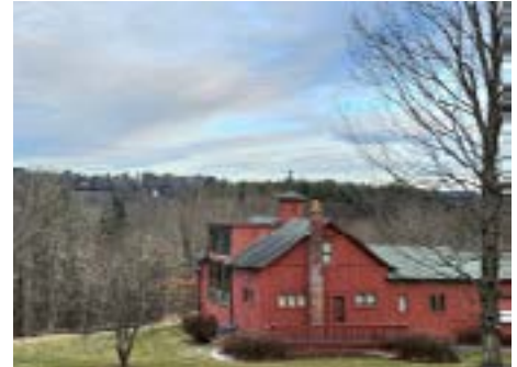
Studio on the Museum Campus, right

Norman Rockwell, as most of you may know, produced many covers for the Saturday Evening Post publication and many other publications and was commissioned to paint the portrait of every major presidential candidate from 1952 to 1972. He was known as “the people’s painter”. Here is Rockwell with his portrait of Dwight D Eisenhower and Adlai Stevenson and (6) plus his first of the 323 Saturday Evening Post covers. There is one room at the museum dedicated to just cover pages.