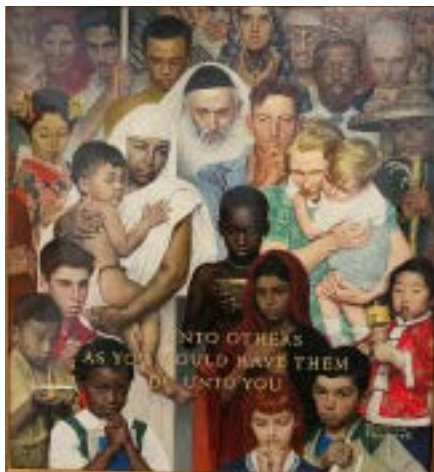
"Golden Rule" Do unto others as you would have them do unto you.