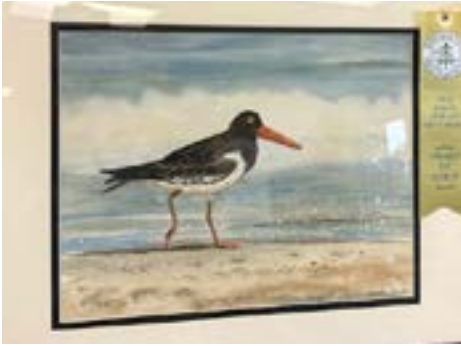
Sheila Soyster, "The Oyster Catcher"