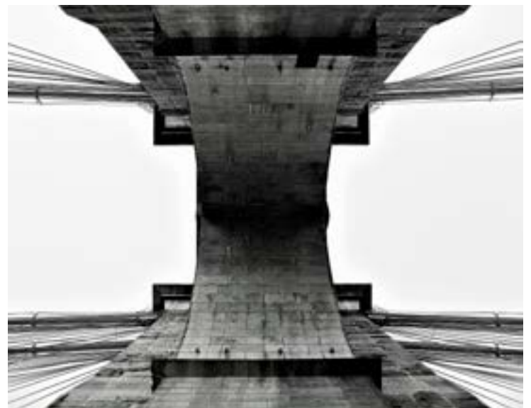
Brooklyn Bridge, photograph