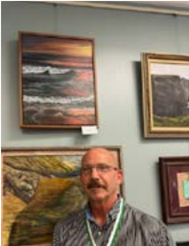
COMPOSITION SEASCAPE: John Troisi, "Autumn Rising," Oil The artist's choice of colors is daring. Our eyes are methodically led from foreground to background. The repetition of color unifies the composition. A striking design!