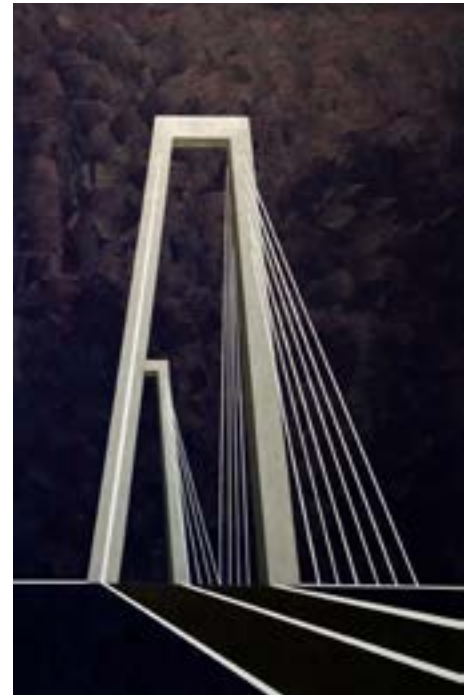
Cooper River Bridge, acrylic