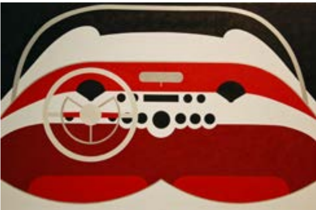
1953 Corvette, acrylic