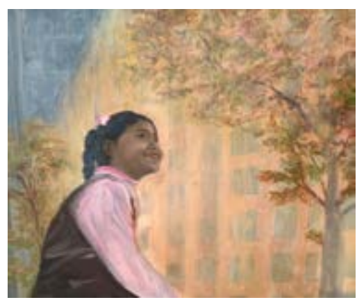
"Thanksgiving Day Parade"