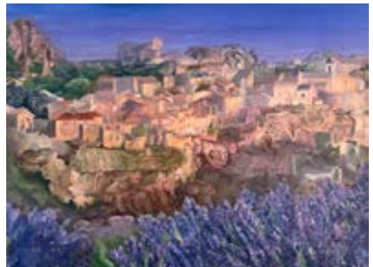
"Winter Lavender, Les Baux de Provence"