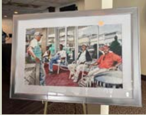
One of Tom's Works