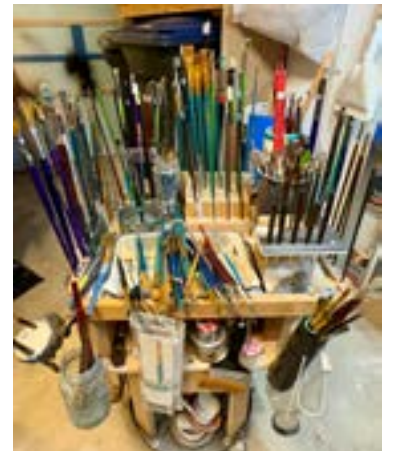
John's custom-built rolling palette and brush stands