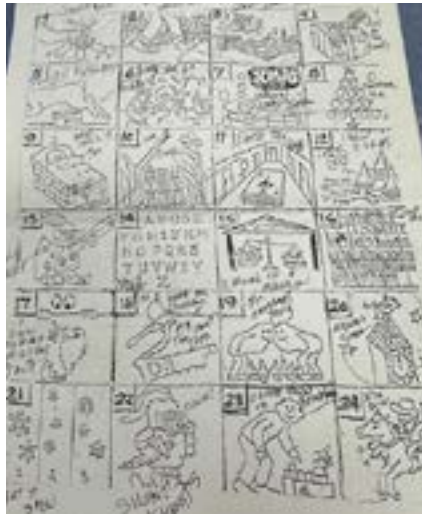
Game card of Christmas Carols