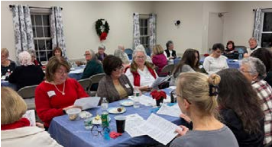
Hard at work solving game