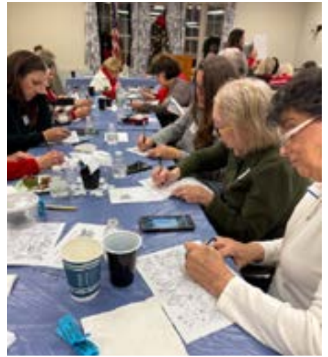
Hard at work solving game