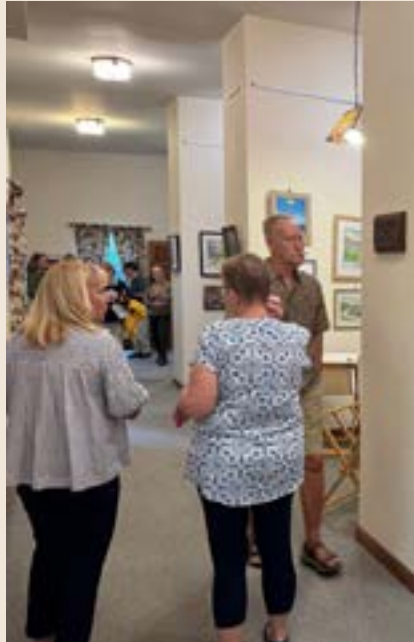
View of gallery show